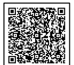
QR code for Application Form

参加申し込みはこちら! Apply here! → http://bit.ly/2sMYWqr *For more information → tiecproject@jasso.go.jp