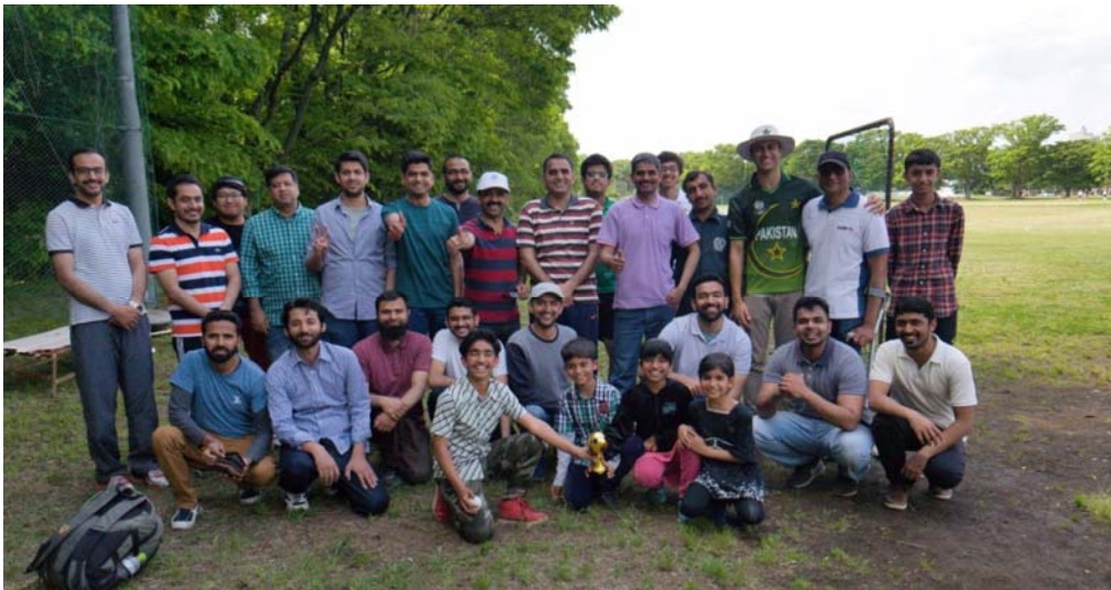
Welcome of New students & cricket matches( May, 2019)