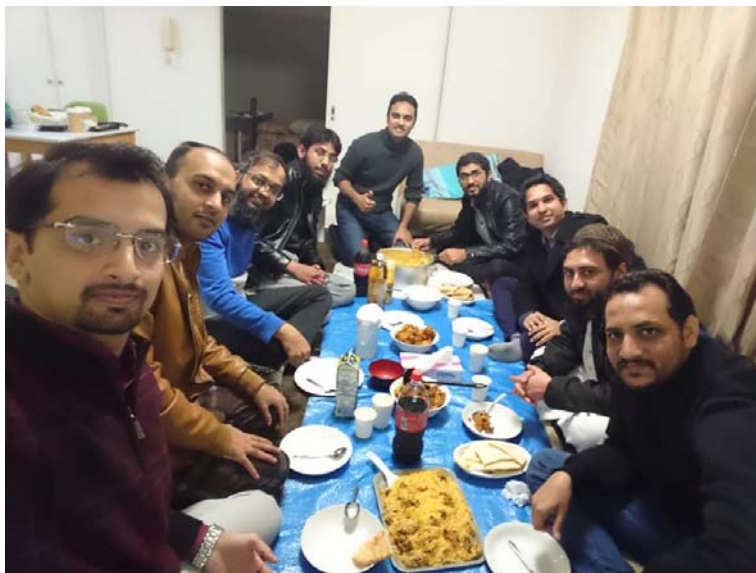
New year party in Osaka for Kanto region under the banner of PSAJ-Kansai Chapter (January, 2020)