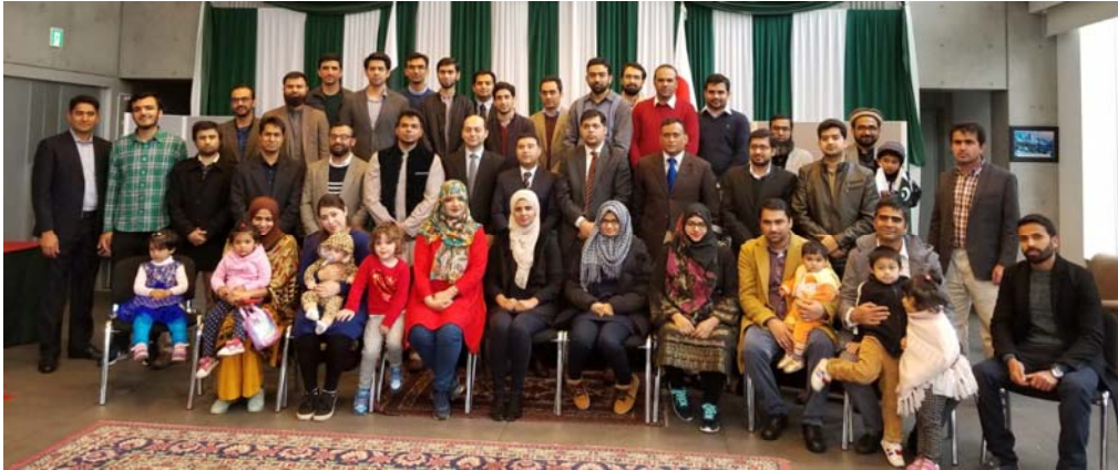
Farewell of Graduating students ( March, 2019)