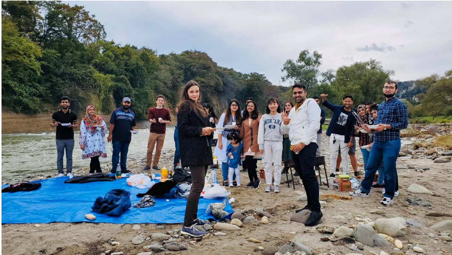
Welcome of New students in Sendai under the banner of PSAJ-Tohoku Chapter (October, 2019)