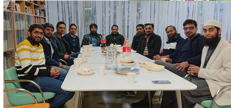
Farewell party in Osaka for graduating students of Kanto region under the banner of PSAJ-Kansai Chapter (October 2020)