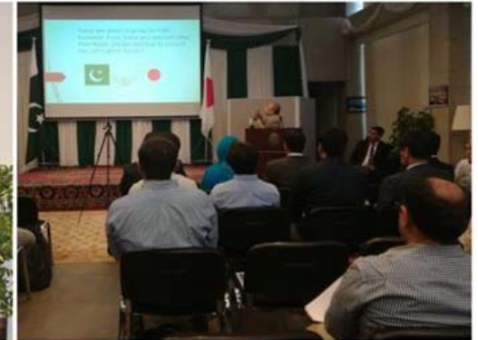
One of the respected Japanese professors sharing his ideas in the PJRF

The Ambassador in his keynote address congratulated the graduating students and urged them to make use of the skill set acquired in Japan for the betterment of both the countries.