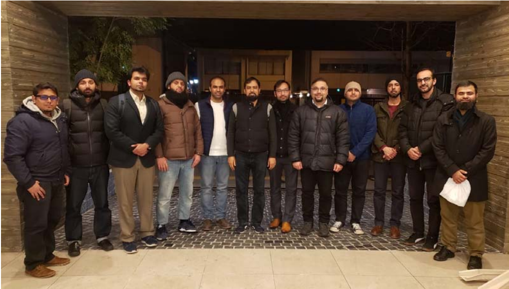
New year get together in Tokyo January, 2020