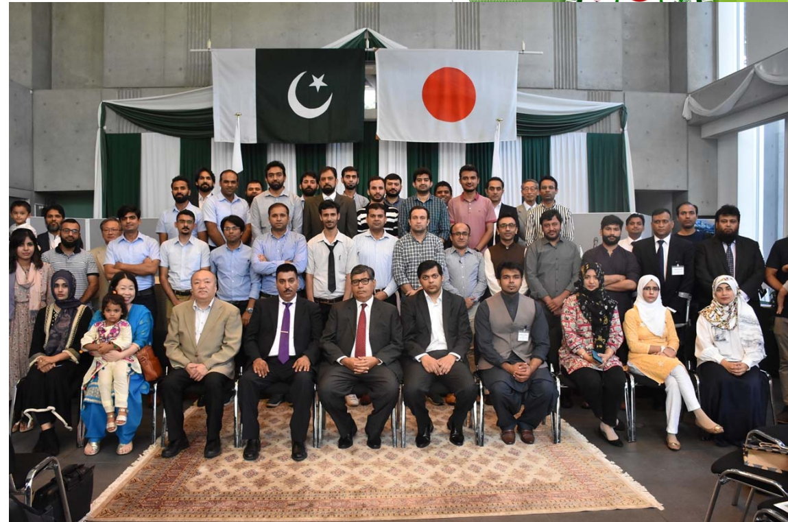
Pakistan-Japan Research Forum September, 2019

The aim of the first inauguration meeting was to launch the forum and to frame ideas on what can Japan and Pakistan do together to strengthen ties in the arena of research and academia.