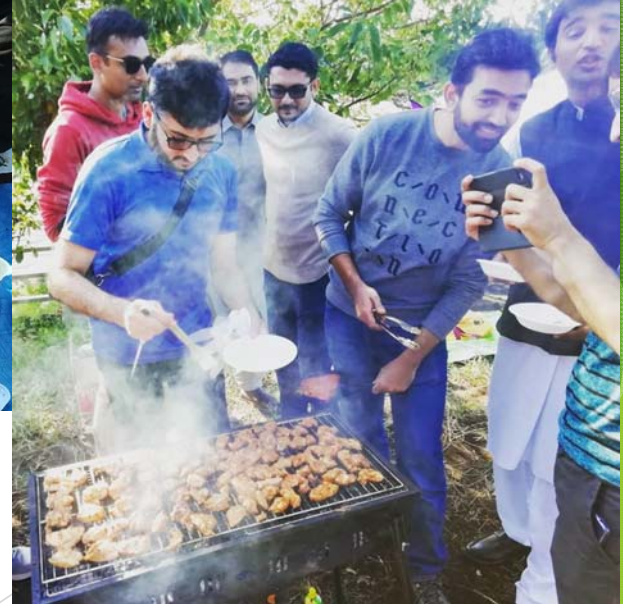
Welcome party of New students in Tokyo for Kanto region (November, 2019)