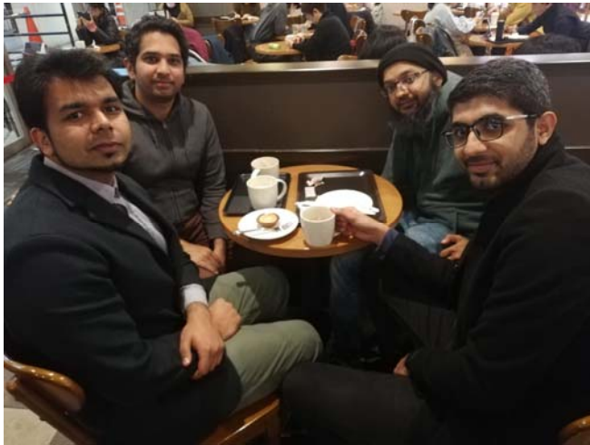
PSAJ Central Cabinet & PSAJ-Kansai Chapter meetup (December, 2019)