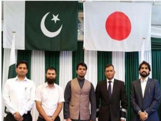
PSA-J Cabinet (Left to Right)