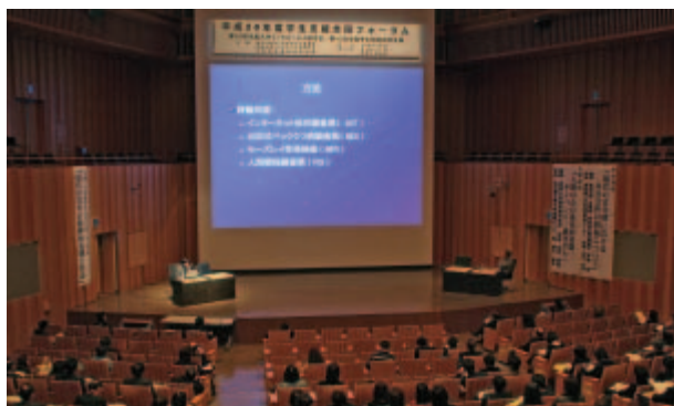
▲FY2008 Joint Forum on Student Support

This forum intends to further improve the mental health care and student counseling functions at universities, etc.