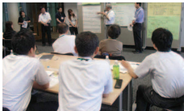
▲FY2008 Workshops for Career Guidance Staff

In order to develop comprehensive and practical career support activities at universities, training courses are conducted to train employment bureau staff and career guidance staff at universities so that they can acquire required skills and qualities to provide adequate guidance on careers to students.