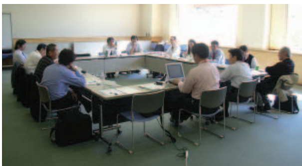
▲FY2008 National Workshop on Student Guidance

This workshop is conducted for university faculty and staff to study measures to develop and improve the quality of student guidance.