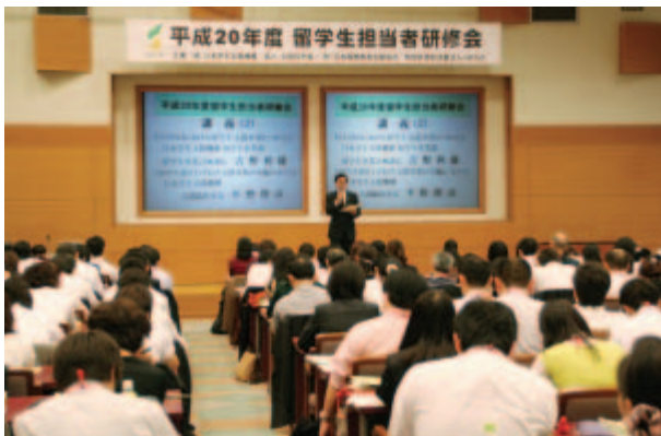
▲FY2008 Workshop for Staff Responsible for International Students

This workshop provides the opportunity to study various issues that come with international students exchange.