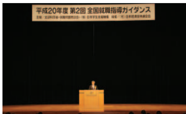
▲FY2008 2nd Sponsoring Nationwide Career Guidance Meeting

In conjunction with MEXT and its Council on Employment Issues, JASSO jointly sponsors the "Nationwide Career Guidance Meeting" with the aim of improving career guidance and ensuring equal employment opportunities. At this meeting, universities and companies exchange information on careers and employment for those scheduled to graduate from universities, etc.