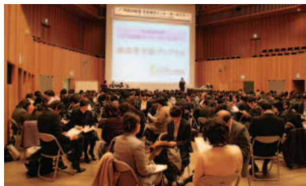
▲FY2008 Workshop for Student Counseling Intaker

This workshop is designed for university faculty and staff who have been recently appointed to student counseling and is aimed at improving the quality of student counseling.