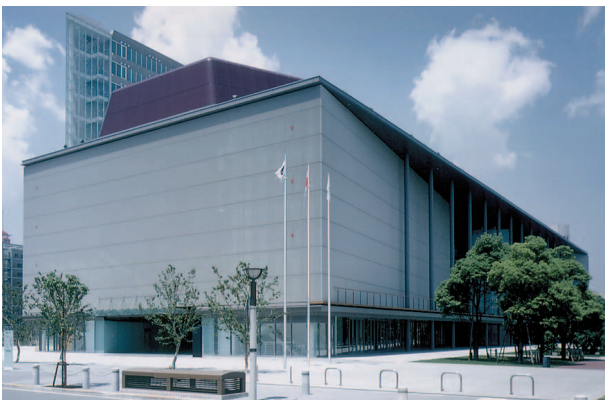
< Plaza Heisei >

Also, as part of Tokyo Academic Park, where exceptional graduate students and researchers from Japan and abroad gather to meet and talk, TIEC conducts various international exchange activities such as international symposiums and festivals.