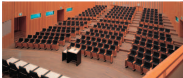
< International Conference Hall >