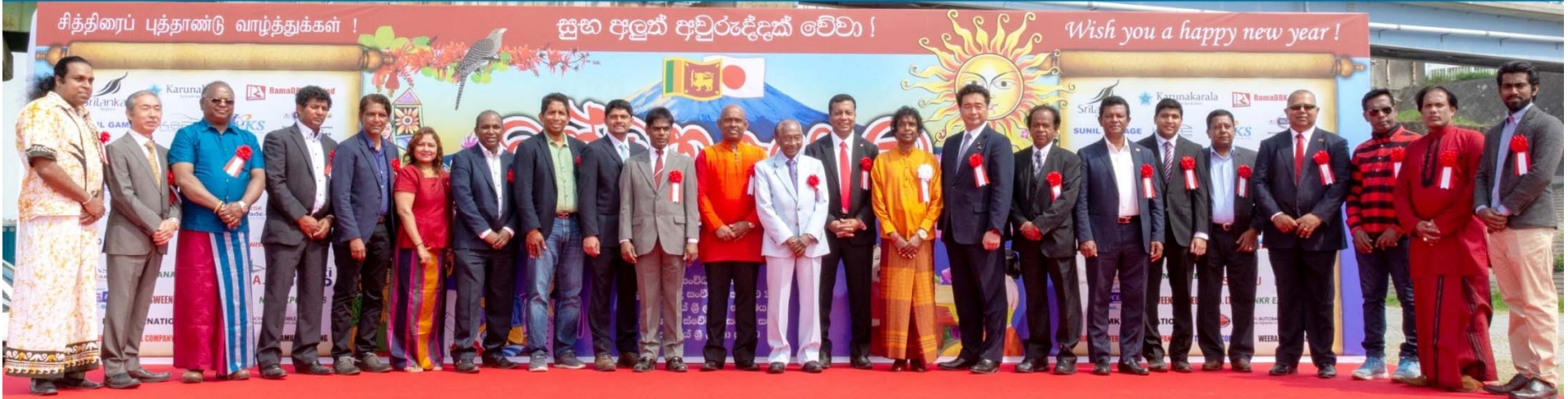
Sri Lankan New Year Celebrations In Japan 2019