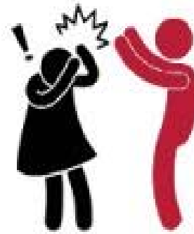
EMOTIONAL & PSYCHOLOGICAL VIOLENCE