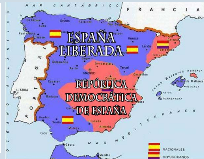
Valenciano(2018) Marca España como estrategia de nation branding