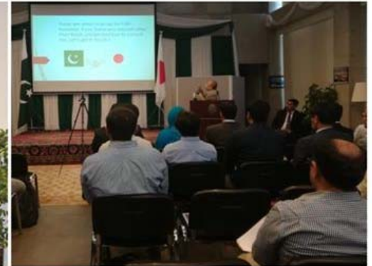
One of the respected Japanese professors sharing his ideas in the PJRF

The Ambassador in his keynote address congratulated the graduating students and urged them to make use of the skill set acquired in Japan for the betterment of both the countries.