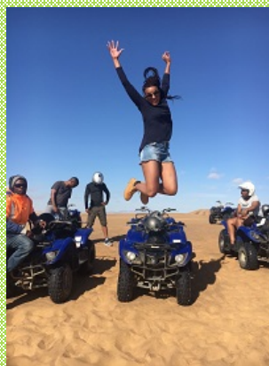
From previous prized photos