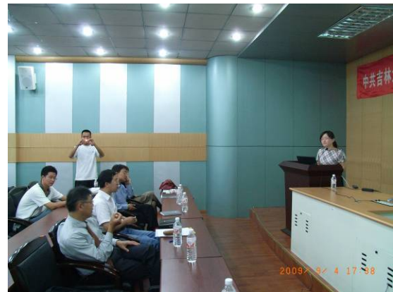
Presentations by graduate students