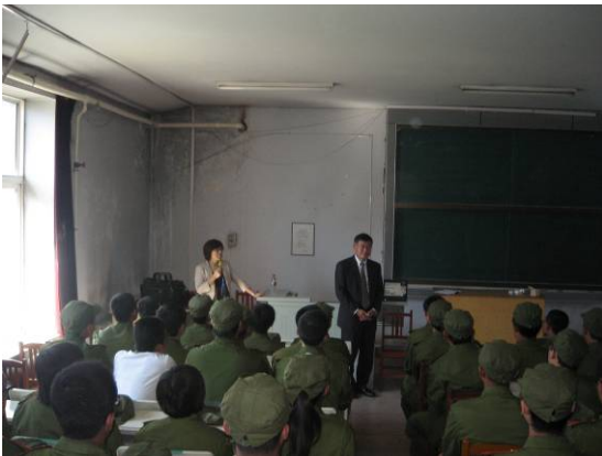
Lecture to the freshmen

The students who go back homeland and work as a researcher after they graduate from the Universities in Japan, often have many problem in their work and studies. At this moment, if they can obtain the guidance and assistance from their supervisor, it will be very helpful. This Project gives a good chance to keep the contact between the supervisor and the student. It will not only be helpful to the students themselves, but also to the communication and cooperation of two institutes.