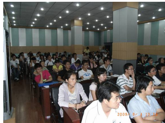
Lecture to the graduate students