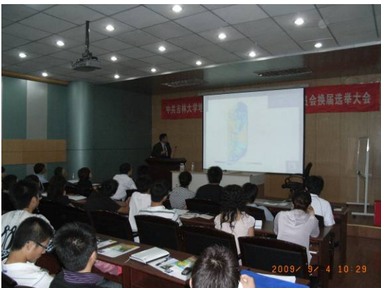
Lecture to the graduate students