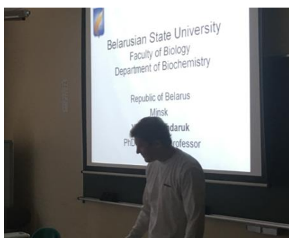
Seminar at Miyazaki University / 宮崎大学訪問時のセミナー風景

It has been known that flavonoids in blood stream are present mainly as glucuronidated, sulfated and methylated derivatives. Therefore, it will be essential to estimate amounts of these metabolites in vivo after oral luteolin administration as well as their binding with nanoparticles and their effects on penetration of model blood-brain barrier and accumulation in brain tissue. Due to the limitation of research periods, we could not try measurements of metabolites and the effects of other type of nanoparticles. We should also check suitable nanoparticles as flavonoids carriers for in vivo administration . We will continue the collaboration with Dr. Banraduk for application of nanoparticles to enhance the bioavailability of flavonoids in vivo.